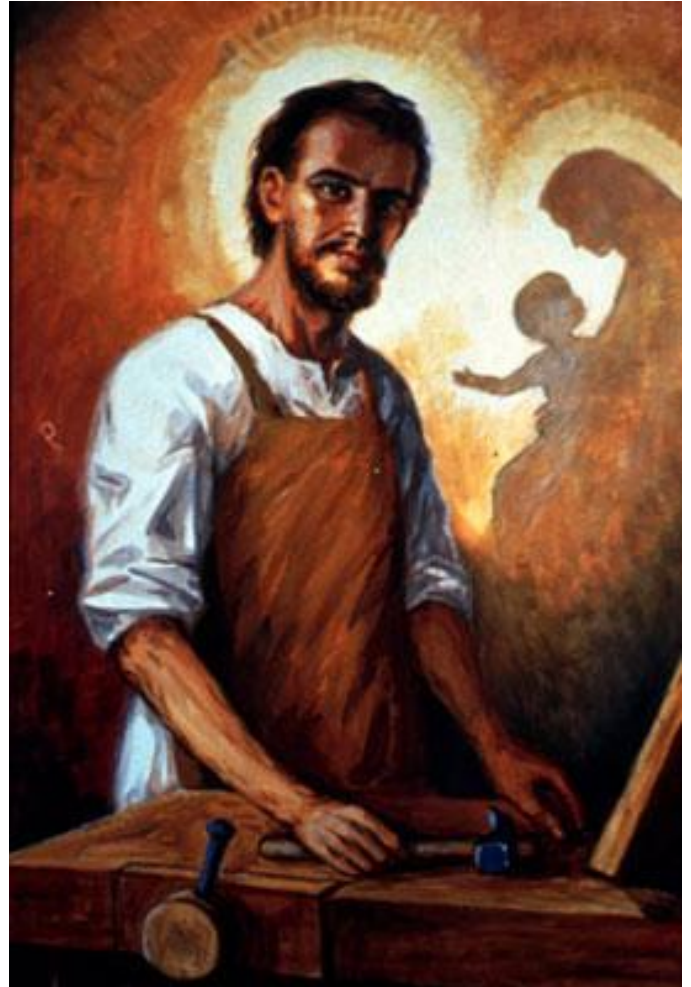
St. Joseph the Worker, Feast Day: May 1 Year of St. Joseph

God our Father, Creator and Ruler of the universe, in every age you call us to use and develop our gifts for the good of others.